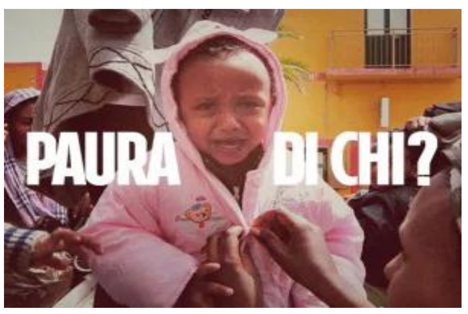
Translation: scared of whom?

Doubt thou the stars are fire, Doubt that the sun doth move, Doubt truth to be a liar, But never doubt I love. Hamlet (2.2.113)