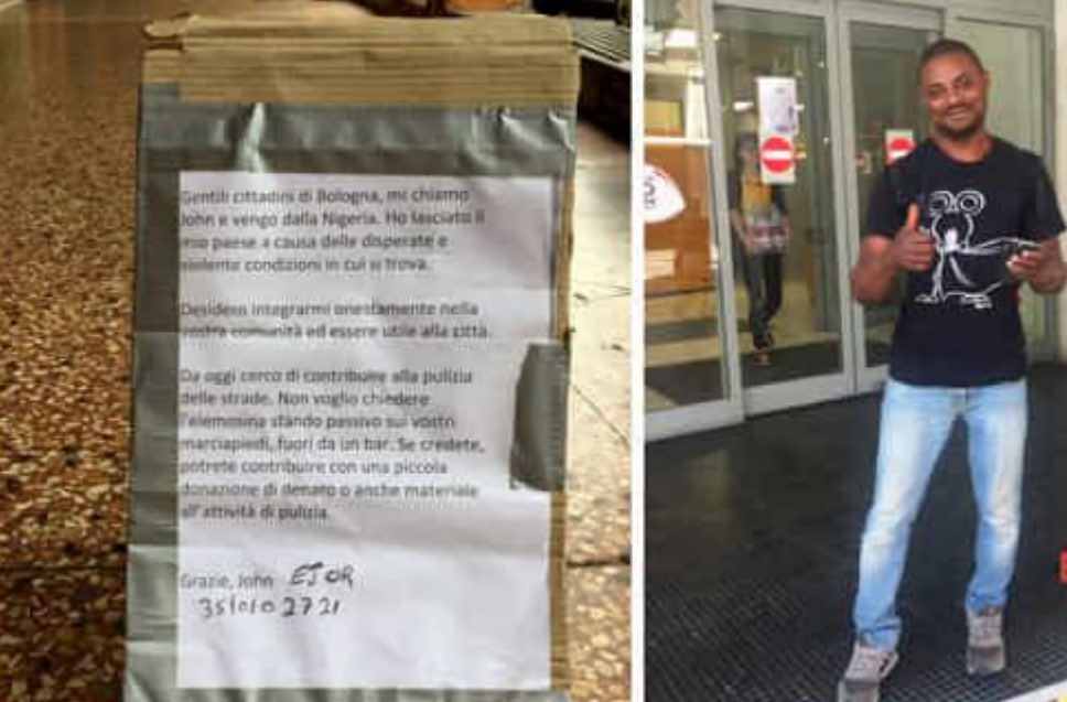
A refugee offers to clean streets and public places, he refuses free donations from people – A true story from Italy *